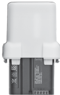
Extended Life Battery with Shuttle