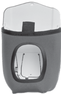
PowerShell with Neoprene Sleeve